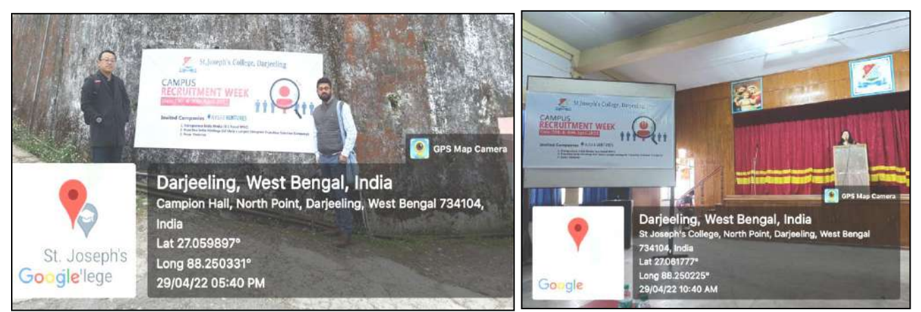
Campus Recruitment Banner